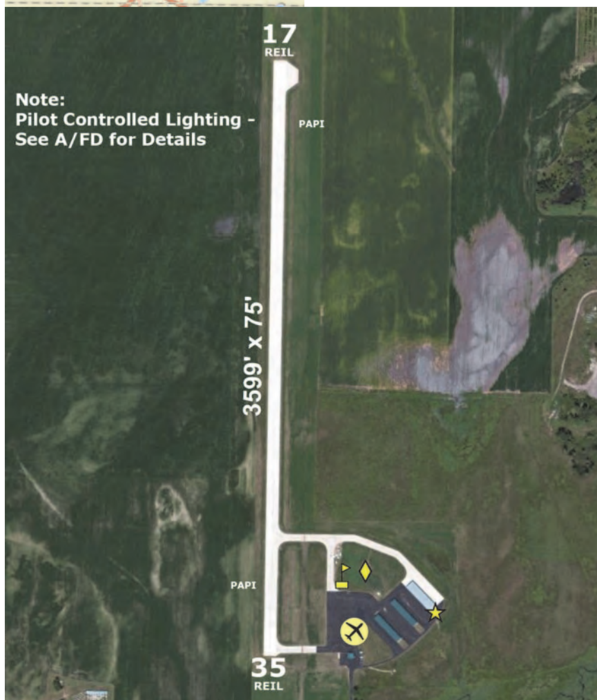
Windom Municipal Airport